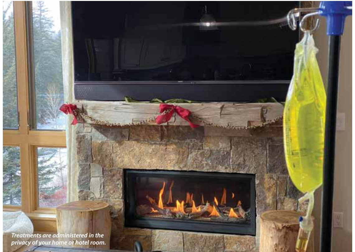
Treatments are administered in the privacy of your home or hotel room.

Our membership program was designed with locals and second homeowners in mind